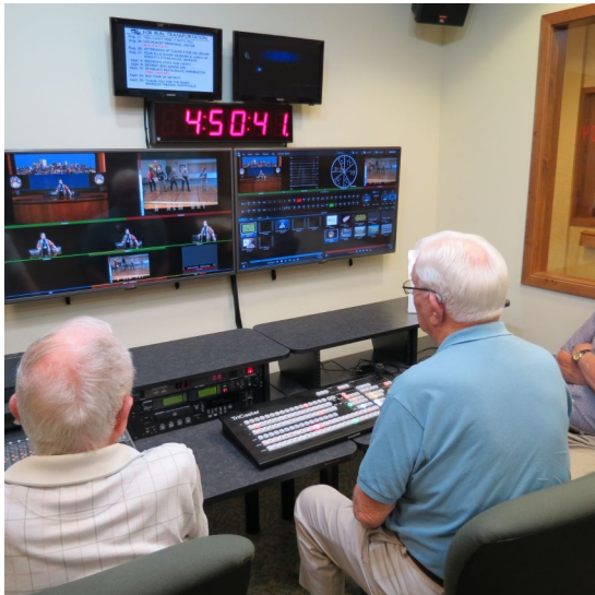
Ramona Remote Control Room

The San Diego Digital Amateur Radio Television Society (SDATV) has ATV repeaters. They also now operate FCC licensed Low Power TV stations (LPTV) in Ramona, CA and Oceanside, CA. Both stations are running the new USA digital broadcast standard, ATSC 3.0 To find out more about LPTV, check out the FCC web site: https://www.fcc.gov/consumers/guides/low-power-television-lptv-service