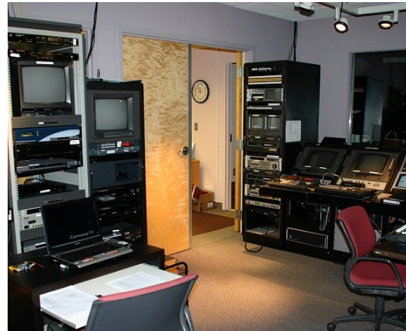
Oceanside Studio Control Room