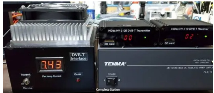
Typical Digital ATV Station. Just add a TV, camera and antenna.

SLATS has ATV equipment for loaning out to prospective hams expressing an interest in getting on ATV. If this is you, then click ( https://slatsatn.net/want-to-try-atv/ ) .