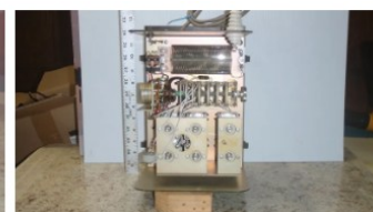
HALLCRAFTERS REMOTE ANTENNA TUNER