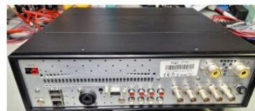
SALE FLEX 6700 SDR RADIO SALE

Armand, KDØPXF, has a free 42" monitor for anyone to pickup. It is a Gaming or Computer Monitor, not a TV monitor. It has SVGA, composite, and component inputs up to 720P and 1080i and works fine! Any questions or to arrange a pick-up please contact Armand armandh@sbcglobal.net