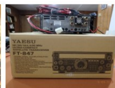
YAESU FT 847 ~ HF/50/144/430 Mhz