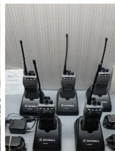
MOTOROLA SU42 SPIRIT PRO TWO-WAY RADIOS