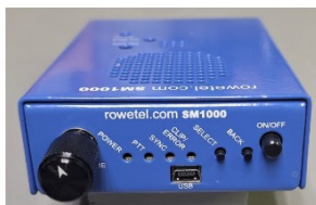
SM-1000 HF DIGITAL VOICE ADAPTER