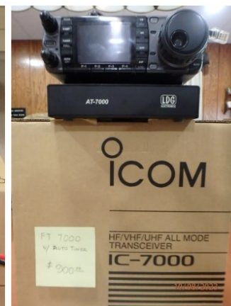
ICOM IC-7000 with LDG-7000 AUTO TUNER