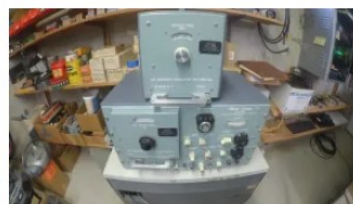
Free VHF/UHF Sweeping Oscillator